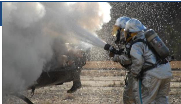
Army soldiers extinguish a burning helicopter during a training mission at Fort Pickett.

In addition to live fire, aviation, riverine and airborne ranges, the fort is one of the nation's premier technical and tactical water and petroleum training sites, providing essential training for logistics and transportation units based at Fort Lee and Fort Eustis. This unique training includes five sites for Army ROWPU (Reverse Osmosis Water Purification Unit) operations, and extensive construction areas for both water and petroleum pipelines.