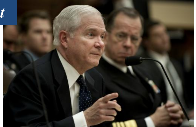
Secretary of Defense Robert M. Gates testifies to the House Armed Services Committee about the fiscal year 2011 DoD budget request, February 3, 2010.

The implications of the QDR for Virginia are many, but perhaps most importantly to the Commonwealth is the review’s call to homeport an East Coast carrier at Naval Station Mayport, Fla. As all five of the East Coast’s carriers are currently assigned to Norfolk, this could mean a loss of billions of dollars in economic benefit to Virginia. The Virginia delegation, led by Sen. Jim Webb, has been fighting the move since it was first proposed by the Navy, on the grounds that it will cost nearly a billion dollars to complete, money the Navy needs to spend on shipbuilding and facility modernization.