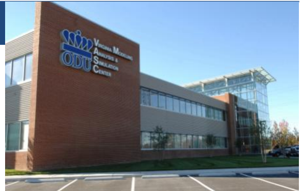
VMASC is a multi-disciplinary modeling, simulation and visualization collaborative research center managed by Old Dominion University.

Visit www.modsimworld2008.com for more information.