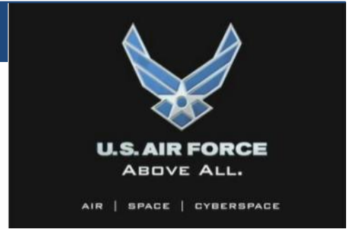
The Air Force's "Above All" recruiting campaign debuted on February 24 of this year. The service's foray into cyberspace is now in question.

Further decisions on Cyber Command's fate will be delayed until the Air Force's new leadership, Secretary Michael Donley (pending Senate confirmation) and Chief of Staff Gen. Norton Schwartz, have time to review the scope and mission of the command.